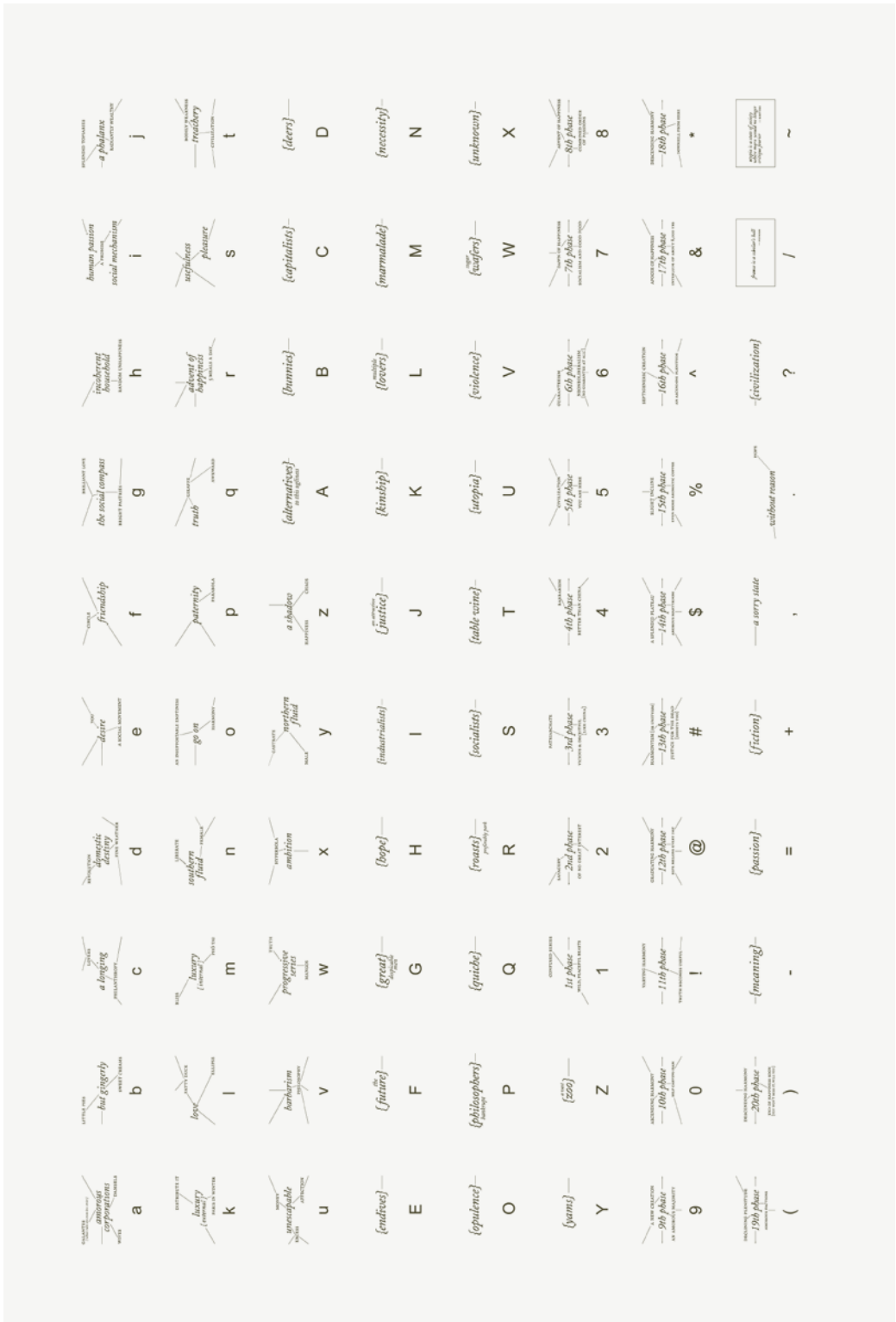
↑ The Future Must Be Sweet (2001), 44" x 30", Screenprint on Stonehenge white paper, edition of 12.