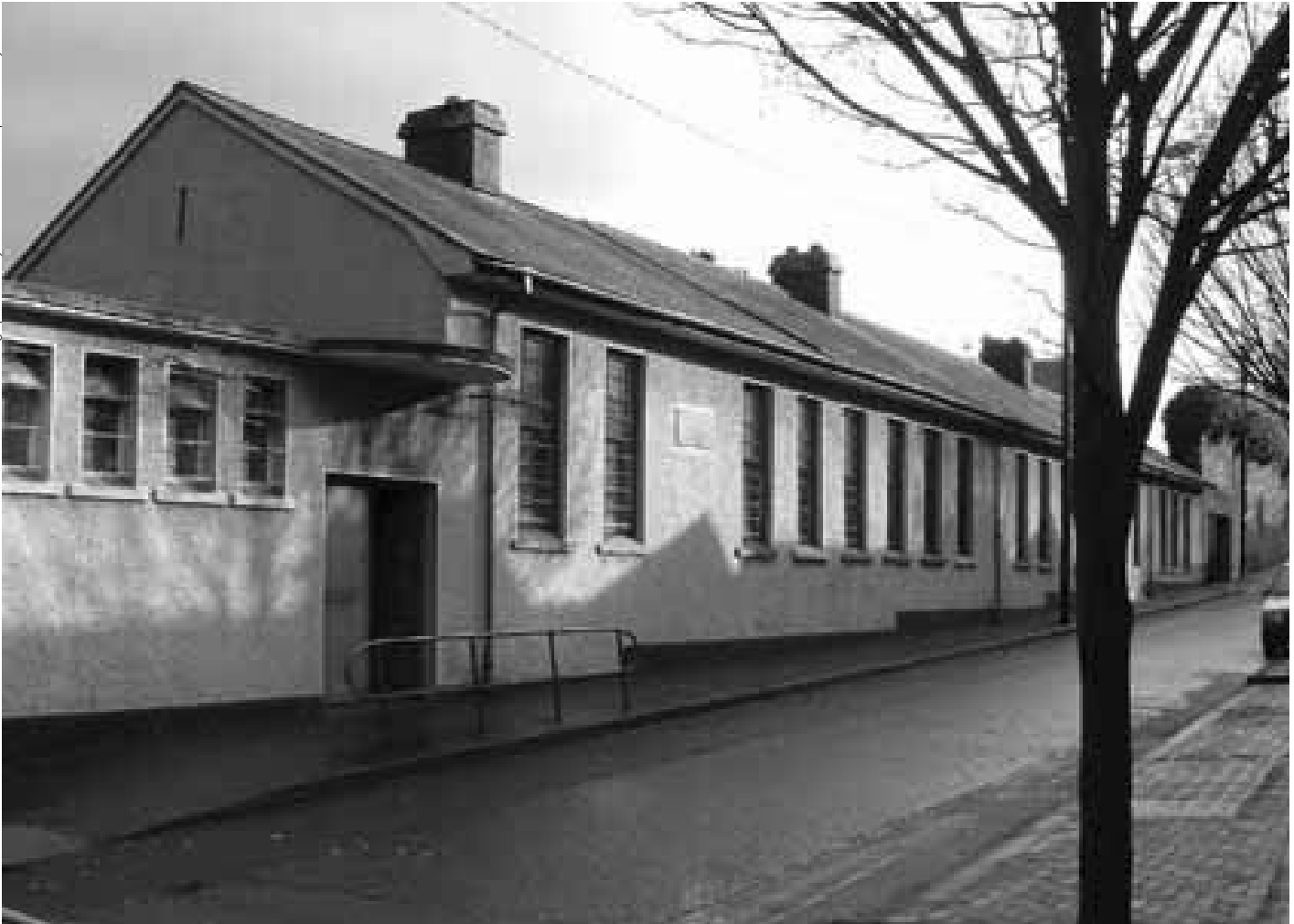
Caucus Centre, Evergreen Street, Cork

We've tried to ask is whether art can be used as a place from which to create new discourses, exchanges and forms of democracy.